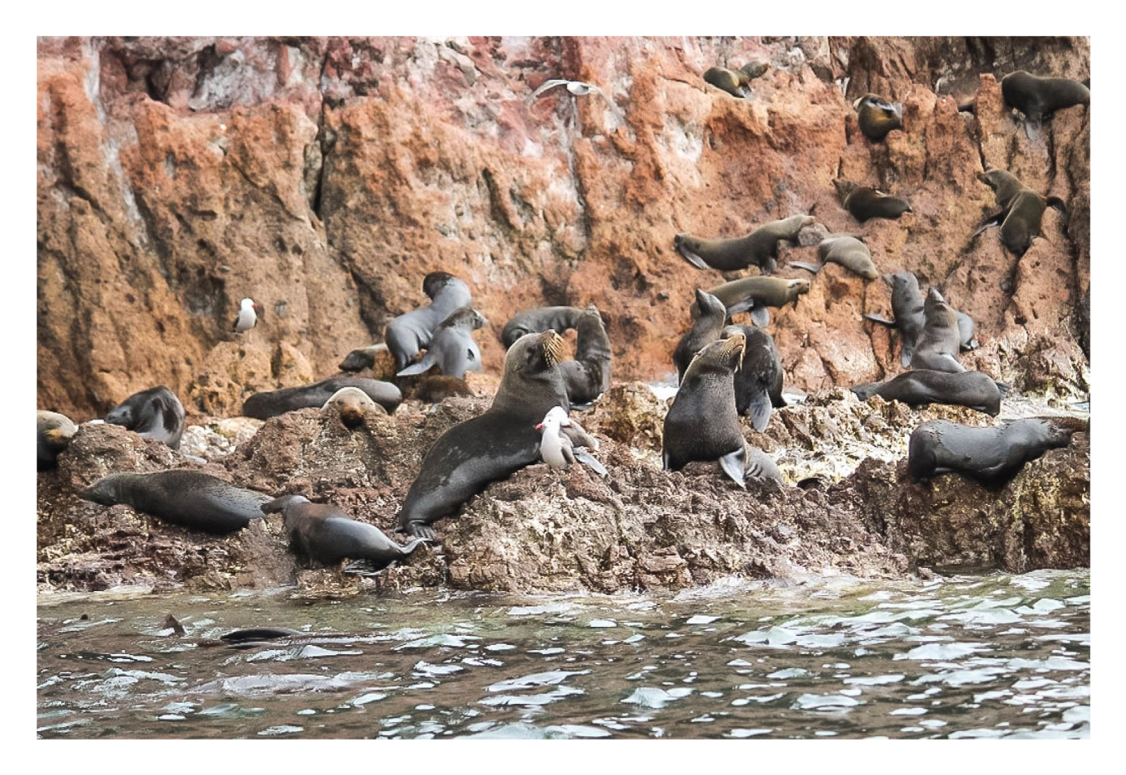
FIGURE 4 Juvenile and subadult Guadalupe fur seals along the northeast side of El Farallón de San Ignacio Island (May and June 2020).