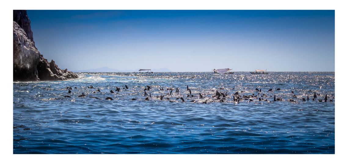
FIGURE 5 Artisanal fishermen catch fish using handlines around the margins of the east side of El Farallón de San Ignacio Island while a group of Guadalupe fur seal rafts near the haul-out (May and June 2020). Photo: Jorge Paul Orduño García.

FIGURE 4 Juvenile and subadult Guadalupe fur seals along the northeast side of El Farallón de San Ignacio Island (May and June 2020). Photo: Jorge Paul Orduño García.