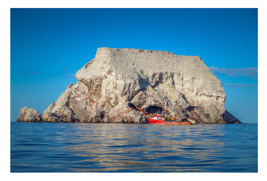
FIGURE 2 The east and north sides of El Farallón de San Ignacio Island (Sinaloa, Mexico). The seine boat passing in front of one of the steep rocky haul-outs used by Guadalupe fur seals participates in the sardine fishery.

The colony of Guadalupe fur seals we discovered in 2014 on the southeast side of the Gulf of California at El Farallón de San Ignacio Island began forming five years before the Las Ánimas colony was noted (Table 1, Figure 2). We were uncertain at that time whether the few animals we initially saw were an anomaly and returned to the island for the past 6 years to confirm their continued presence, growth and establishment of a permanent colony. This small arid island is comprised of steep jagged rocks (536 m diameter and 142 m high) and is home to ~500 California sea lions ( Zalophus californianus ). It is surrounded by deep water (>3,000 m), except for the rocks to the north (Maluf, 1983). Fur seals using the island tend to climb up the steep rocks to rest (Figure 3), and animal densities are highest on the east and southeast sides of the island.